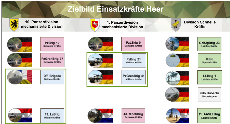
Figure 1 Organigram of German army divisions with Dutch units incorporated

Importantly, this does not mean that the Dutch brigades are commanded by German divisions on a permanent basis. Dutch forces remain primarily garrisoned in the Netherlands, and certain tasks (e.g. personnel policy) remain under national control. Both German and Dutch forces remain under national control and constitutional arrangements. 100 It must be noted that changing command relationships, especially at the brigade level and above, is standard procedure within NATO. The fact that units are assigned to higher level formations does not automatically mean that these units cannot be separately deployed. The assignment of brigades and divisions within particular arrangements, be it through NATO (German-Dutch formations have important roles assigned to them in the new NATO plans, see §3.1) or in a German-Dutch context, implies a commitment to provide forces if a decision is taken to use force and an agreement is reached on the activation of the combined command arrangements by the chiefs of defence.