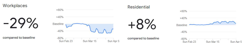
Figure 1: Google’s ‘COVID-19 Community Mobility Reports’ – data for the Netherlands from February 16 th to April 5 th , 2020

In order to increase transparency, aggregated location data may potentially be shared with the public. An example is Google’s ‘COVID-19 Community Mobility Report’, which provides open-source data on the changes in people’s behavior since February 16 th per country (see the report of the Netherlands in Figure 1, which was cited in an RIVM briefing to the Dutch Parliament). 23