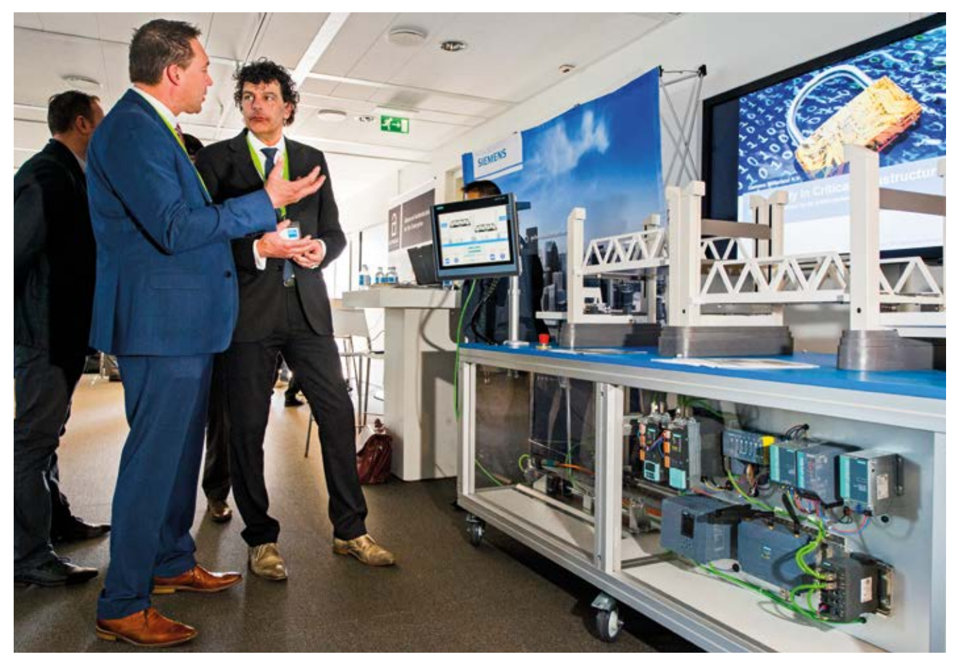
Demonstration SCADA hack bridge by Siemens during Cyber Security Weeks Innovation Room at HSD Campus

A testbed is a platform where CI operators and manufacturers can test their hardware and software in a protected simulation environment. Also referred to as a Sandbox , a testbed is an isolated testing ground where IT and OT components can be tested for vulnerabilities.<sup>12</sup>