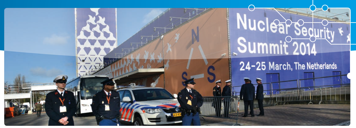
HSD Issue Brief 2/2014