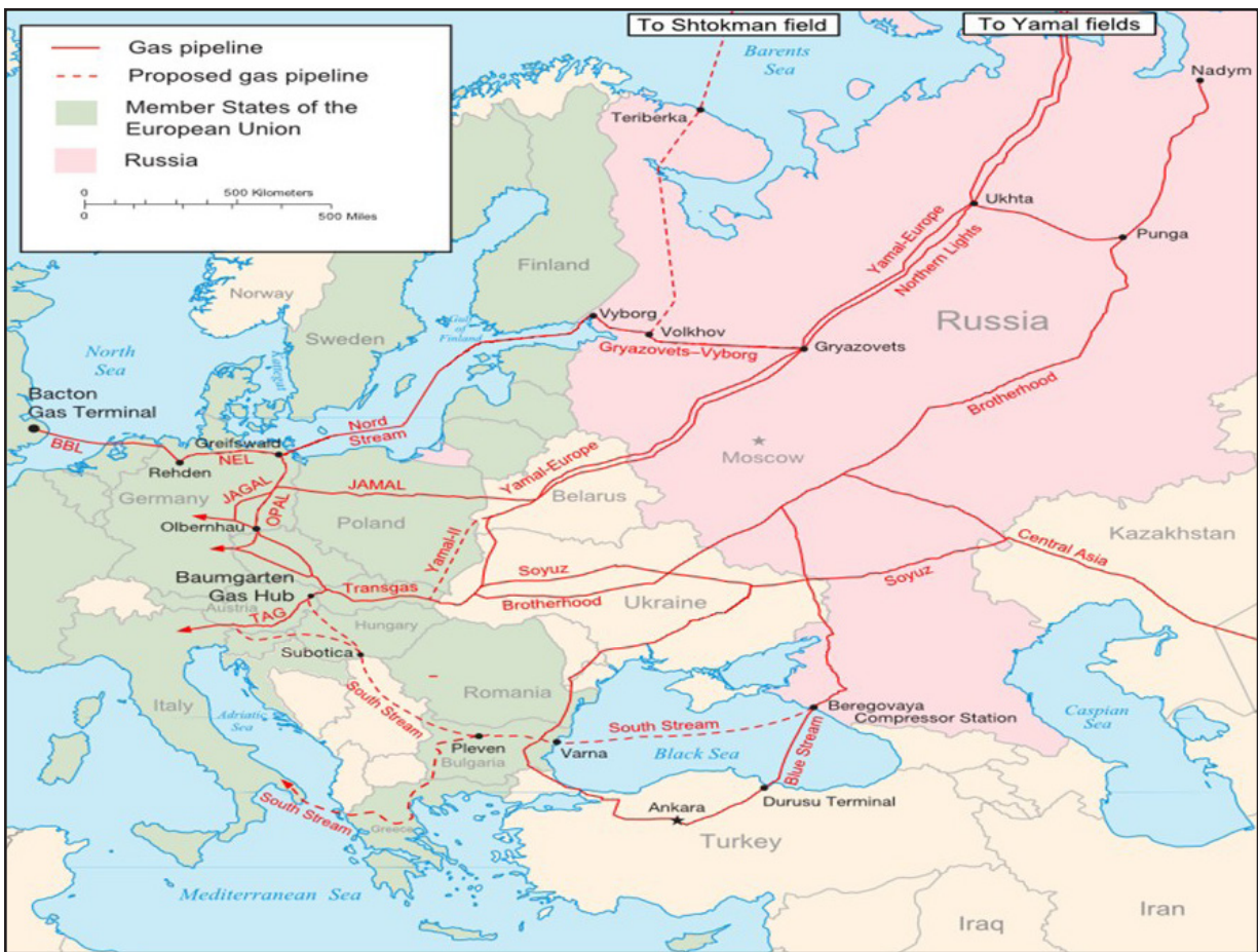
Figure 2: Russian Gas Pipelines

In this scenario, the teams explored the implications of a more energy independent Europe within the next five years. This scenario assumed that Russian attempts to fracture NATO through energy leverage deals had backfired and a unified Europe reacted by seeking alternative energy sources. Consequently, the United States and Europe started to earnestly develop the necessary infrastructure and diversification to insure their energy needs without fear of Russian manipulation or leverage.