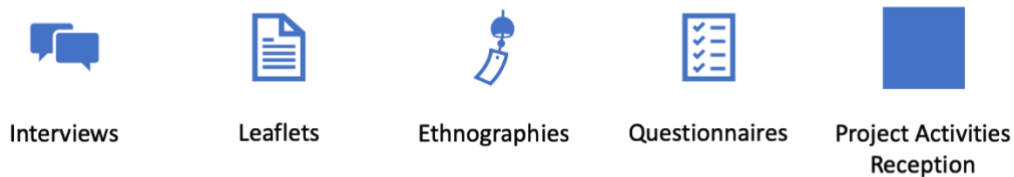
Figure i: Measurement tools to understand the impact of the lifestories approach.

The policy brief proposes to measure the impact of the lifestories approach through mixed methods. The tools used for it are interviews, ethnographic observations, questionnaires, and project activities reception (please see Figures i and ii). The proposed methods are complementary, therefore providing an in-depth assessment of the intended impact. For example, questionnaires provide a solid evidence-based measure on how videos changed the perception of stigmatization or attitudes towards violent extremism, while ethnographic observations provide richer data on how the communities seem to be affected by the lifestories and how the P/CVE is progressing.